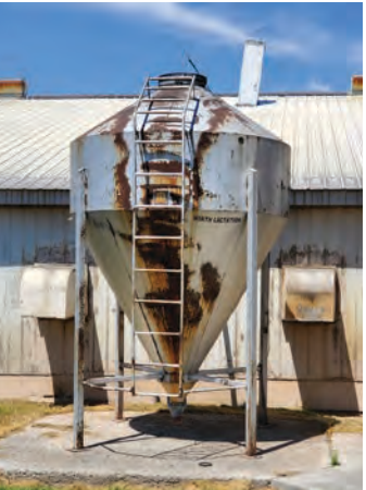
THE CHOICE IS CLEAR