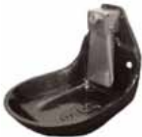
a) Shallow cup drinker (Vittetoe, 2010)