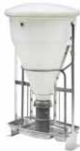
b) Shelf style wet/dry feeder (Vaucluse, 2010)

Studies reported in literature have shown pig performance is not negatively affected by drinker type, assuming proper drinker and water supply management. Therefore it is assumed the difference in total water usage between the sites in Table 1 is due to wastage associated with each drinker type.